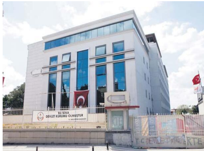
Fem Prep School in Altunizade, Uskudar (USD 43.402.777, as of 23 July, 2016)

According to the General Directorate of the National Estate, 743 prep schools were closed and confiscated by Emergency Decree. 104 The Turkish media reported that one of these estates, the building of the FEM Prep Schools in Uskudar, Istanbul, was appraised at TL125 million (USD43,402,777, as of 23 July 2016) by the public authorities. 105